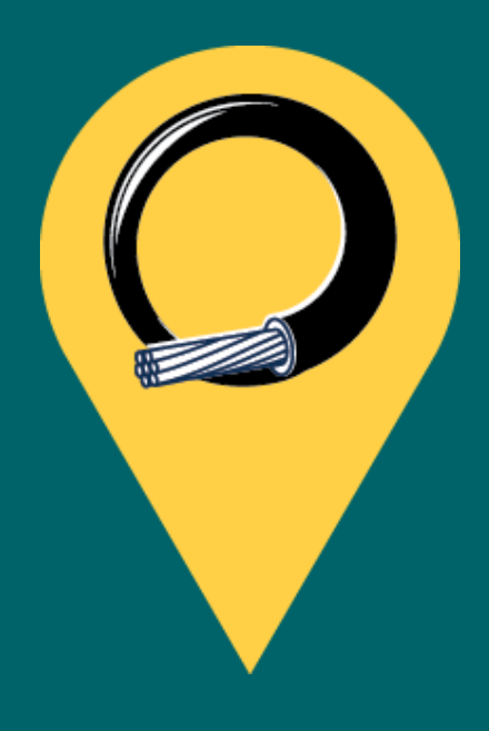
Hardening the Electric Grid