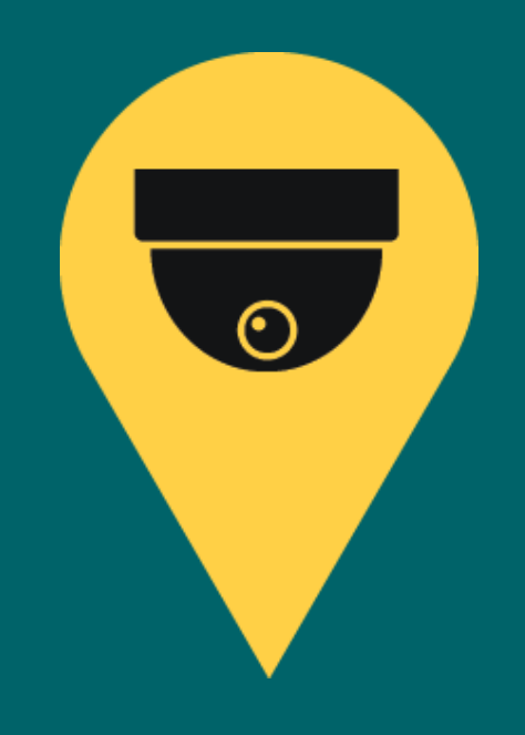
Bolstering Situational Awareness Capabilities