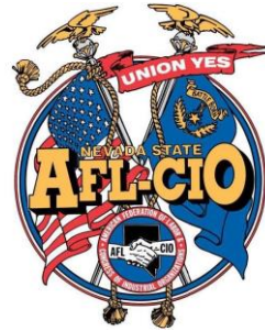
Nevada State AFL-CIO