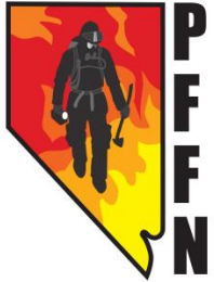
Professional Fire Fighters of Nevada